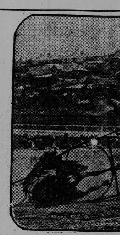
A stirring picture of a three-cornered spill in the trotting races at Epping in New South Wales. On the left is the first horse to fall. His driver lies full length beside the sulky. The centre and right gips were so close they could not turn out. The centre one is still in mid-air, the driver's foot being all that can be seen of him beyond his fallen horse. The driver on the right has not yet overturned, but is on his way. Note seat cushion high in air.