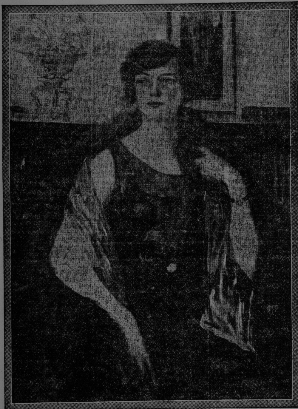
In this portrait of Mrs. Longworth, recently painted in the library of her home in Washington by the distinguished American portrait painter, Wayman Adams, her vital beauty and the charm of her magnetic personality are strikingly revealed.

his way from Halifax to Montreal. On Sunday he will be the preacher at St. James' church, where he was formerly rector.