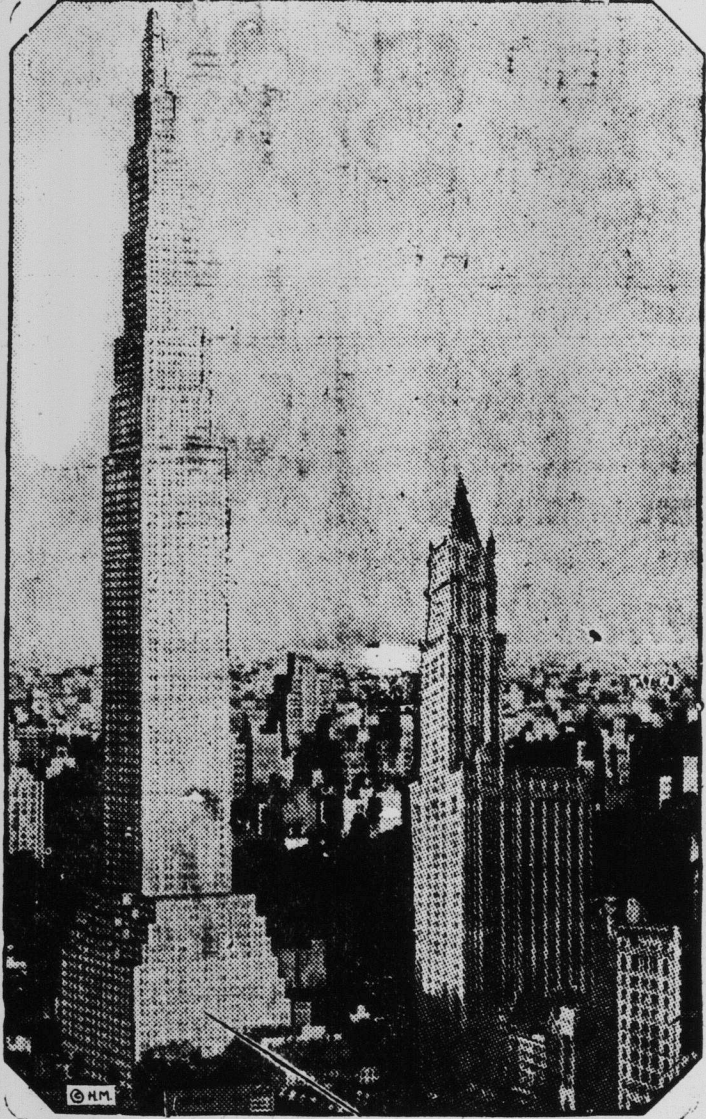
This projected building, 1228 feet high, is to stand in West Forty-second street, New York, regaining for the Metropolis the distinction of having the tallest structure in the world. It is to be 110 stories high. That's 228 feet more than the Eiffel Tower, for 46 years the world's tallest structure, 416 feet more than the Woolworth Building, at present the highest office building, and 228 more than the Detroit Book Tower, which is to be 45 stories. In this picture the spire's altitude is compared with the Woolworth Tower.