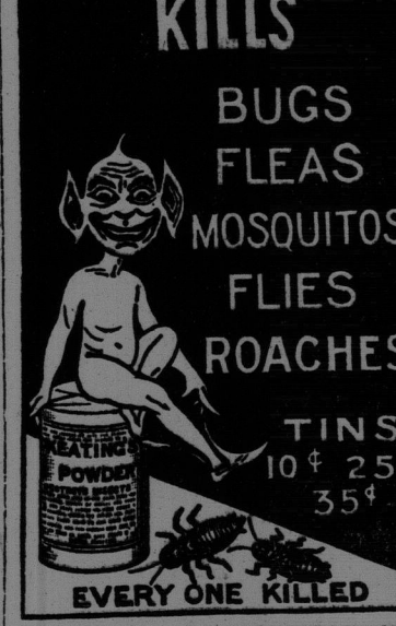
EVERY ONE KILLED