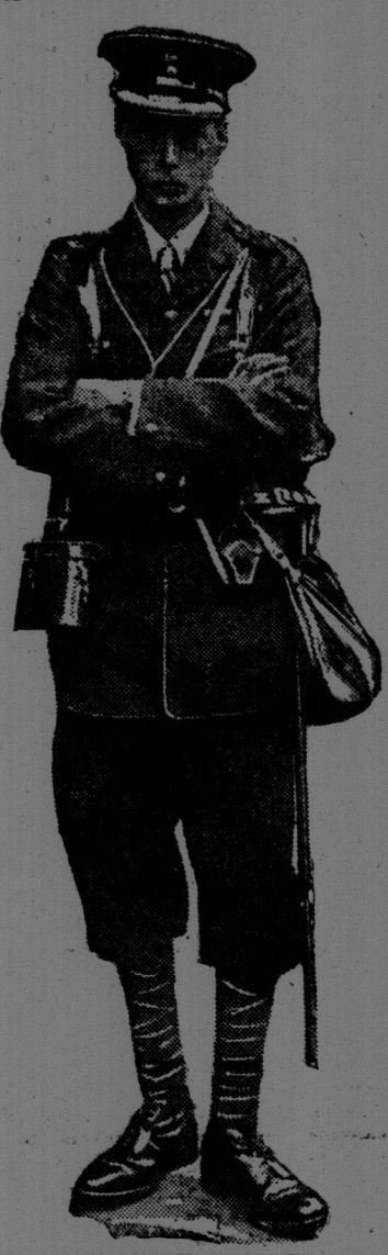
THE ROYAL FAMILY.

SHIPPANTS' ENGLISH SANDWICH MEATS—Ham, Veal, Tongue and Chicken (glass jars). 20c. each 25c. SPECIALS 3 Pkgs. JELLO—Any Flavor. 3 Pkgs. CORNSTARCH. 2 Bottles WORCESTERSHIRE SAUCE. 2 Tins PAN SHINE. 2 Bottles AMMONIA. 2 Tins CORN SYRUP. 3 Pkgs. LUX. JELLO ICE CREAM POWDERS. IMPERIAL JELLIES. LIPTON'S JELLIES. 3 BLANC MANGE POWDERS. 1 lb. WHITE SAGO. Tumblers Jam—Apple Raspberry and Strawberry. Quarts WHITE FRUITS. 2 Tins READYMAID SOUP. 2 Pkgs. SILENT MATCHES.