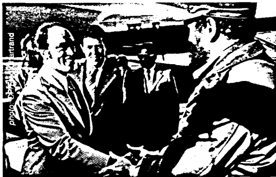
Pierre Trudeau visits Havana in 1976.