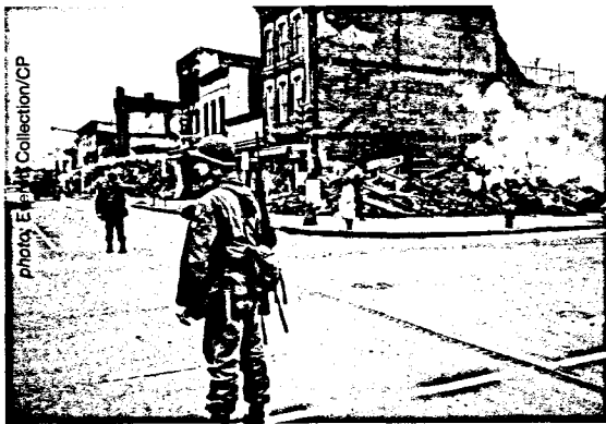
Army patrols follow the King assassination in 1968.