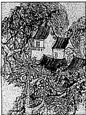
Masterpieces of 20th Century Chinese Painting: an exhibition coming to Canada this year

For information on the APEC SME Business Forum and Exposition contact The GLOBE Foundation: Tel.: (604) 775-7265 Toll Free: 1-800-952-3493 e-mail: appecinfo@globe.apfnet.org