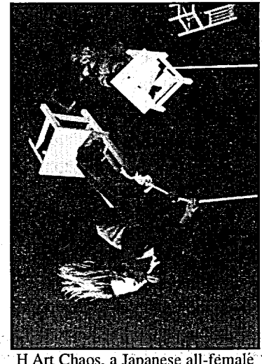
H Art Chaos, a Japanese all-female dance company, will perform across Canada this year

The CYAP cultural website can be located at: www.cyap.com or (in french): www.acap97.com