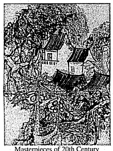
Chinese Painting: an exhibition coming to Canada this year

Tel.: (604) 775-7265 Toll Free: 1-800-952-3493 e-mail: apecinfo@globe.apfnet.org