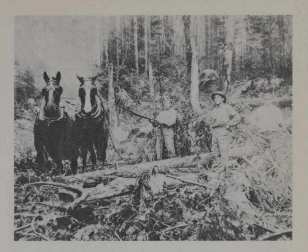
Japanese loggers in the bush during the 1920's.

The British mark is conspicuous not only in Vancouver and Vancouver Island, named after Captain George Vancouver of the Royal Navy, but in Victoria, Prince Rupert, Queen Charlotte Islands and hundreds of inlets, islands, bays and