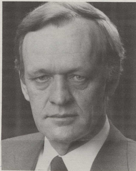
Jean Chrétien, Deputy Prime Minister and Secretary of State for External Affairs.

In his introductory remarks to the meeting in Jakarta, the External Affairs minister said that Canada had maintained its policy of accepting substantial numbers of refugees from Southeast Asia, and he announced that Canada would give