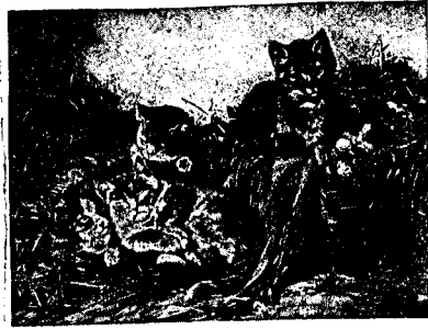
A KITTEN FAMILY. Size, 17 x 18 in. One of 33 studies to be given in a $4 subscription. To be published April 25, 1891. For sale by newsdealers.

Among them are an oblong marine; a "Moonlight on the Snow"; Japanese lilies; "On the