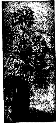
YELLOW CHRYSANTHEMUMS. Size, 33 x 14 in. One of 33 studies to be given in a $4 subscription. To be published April 11, '91. For sale by newsdealers.

Coast of Maine"; full-length study of an Arab Deer's Head; a charming Lake View; three beautiful landscapes in oil: "Spring-