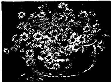
DAISIES IN BLUE NEW ENGLAND TEAPOT. One of 33 studies given in a $4 subscription

Catalogue of studies and descriptive circular sent for stamp.