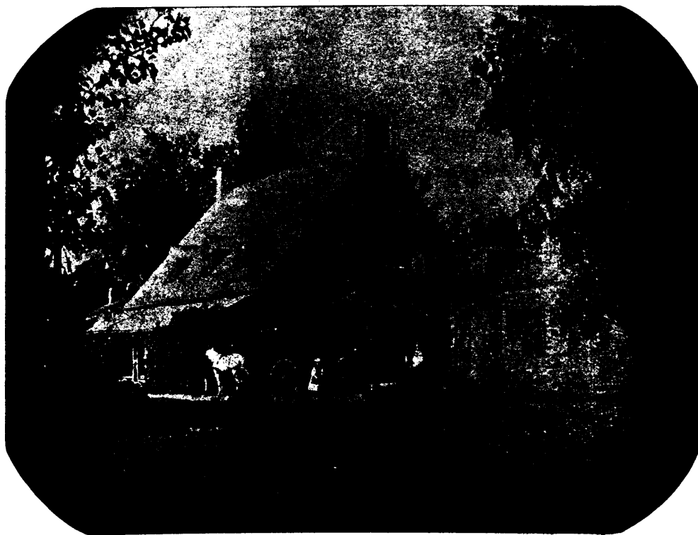
OLD GOVERNMENT HOUSE AS IT WAS THIRTY YEARS AGO.