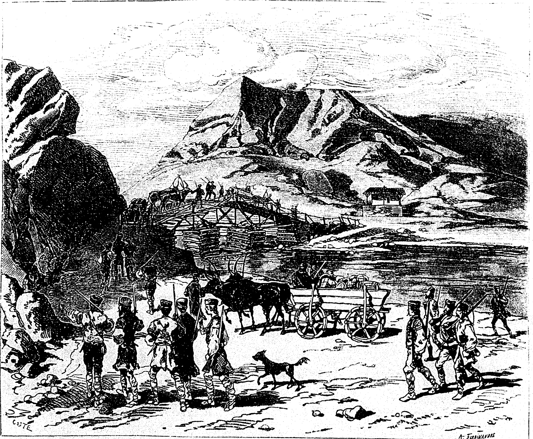
A CONVOY OF INSURGENTS CROSSING A BRIDGE OVER THE DRINA, NEAR STOLATZ.