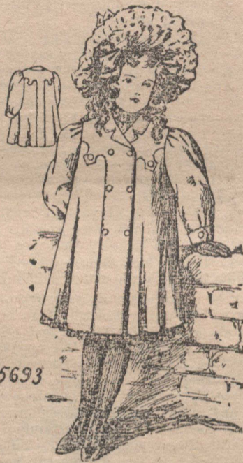
NO. 5693.—LITTLE GIRLS' COAT.

In ordering patterns from catalogue, please quote page of catalogue as well as number of pattern, and size.