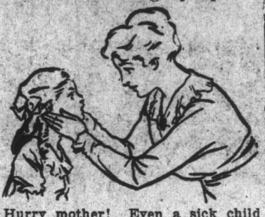
Fig Syrup" and it never fails to open the bowels. A teaspoonful to-day may prevent a sick child to-morrow. If constipated, bilious, feverish, fretful, has cold, colic, or if stomach is sour, tongue coated, breath bad, remember a good cleansing of the little bowels is often all that is necessary. Ask your druggist for genuine "California Fig Syrup" which has directions for babies and children of all ages printed on bottle. Mother! You must say "California" or you may get an imitation fig syrup.

Open Child's Bowels with "California Fig Syrup"