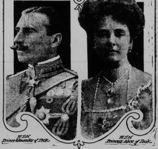
CANADA'S NEW GOVERNOR-GENERAL Who is at the Front with the British troops in France