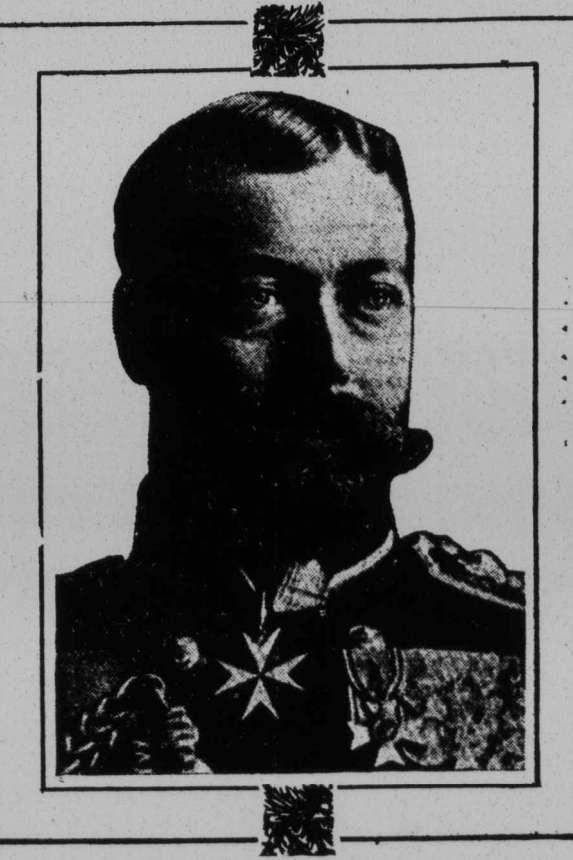
HIS MAJESTY KING GEORGE OF ENGLAND