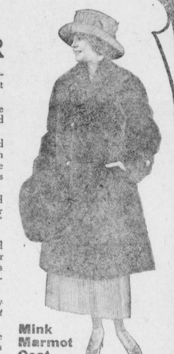
Mink Marmot Coat

This new and attractive coat is the 48-inch length, slightly fitted in the back, has slash pockets, wide reverse border at the bottom, deep slash collar and cuffs, fancy buttons fastening with silk elastic loops.