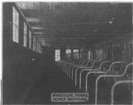
WINDYACRE FARMS HOMER, MICHIGAN

We also build Hay Carriers and Lit- ter Carriers.