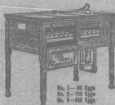
No. 1—80 Eggs No. 2—120 Eggs No. 3—240 Eggs