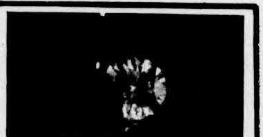
This particular diamond broke across the diameter because of a series of flaws, invisible to the naked eye. An unfortunate blow did the rest.

"There are cases of graduates with their third post-doctoral fellowship who can't find employment," the release says.