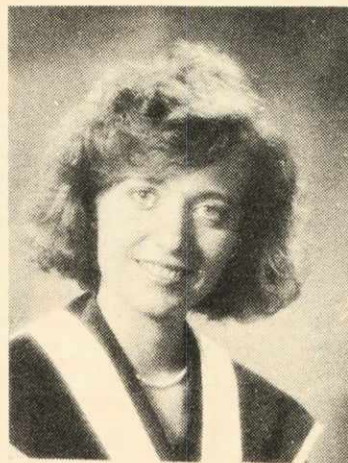
This is one of several styles

7.50 FOR YOUR SITTING You keep your proofs