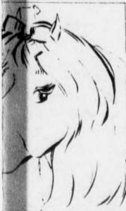
MBA on the #$$@!! corner talking to like you who e mind their %@* business