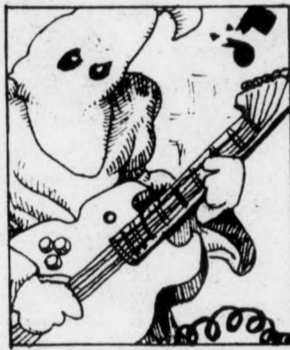
Grand Wizard of the KKK

Informing the world of the Playing Sun City alien invasion force from Cygnus X4.