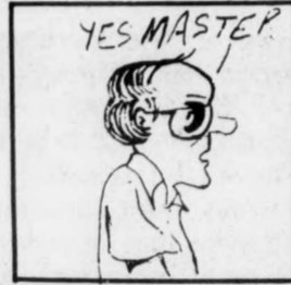
Duke from 'Doonesbury' Anything Go's 1000

If I don't get elected this time, I think that I'll go back to college.