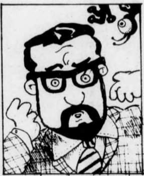
Stanton T. Friedman

Informing the world of the Playing Sun City alien invasion force from Cygnus X4.