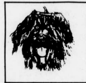
Lucky The Reagan's 'ex'

So I just have a minor pudding problem. Big deal!