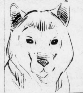
Silver Chief Collecting pornographic black velvet paintings in California.

What do you think the Katimavik hunger strikers have accomplished?