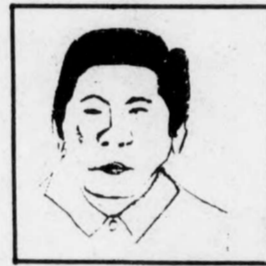
Ferdinand Marcos Master Pillager