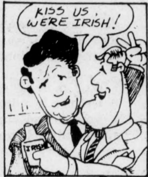
B. Mulroney, R. Reagan