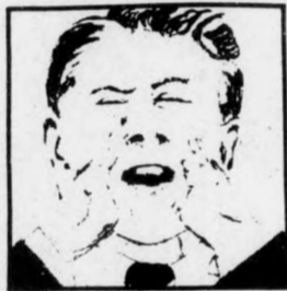
Ronald Reagan President