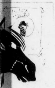
Chem. IV Organize a regional back Panthers chapter!