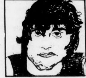
'Sly' Stallone BA Shooting for Money VI