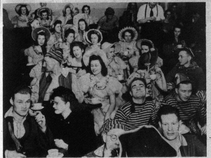
Philharmonic Society, cast of "The Pirates of Penzance," January 1942.

page news in the Gateway as well as Drama. In 1926, for the third time Alberta debaters took on Cambridge debaters; and for the first time, they won.