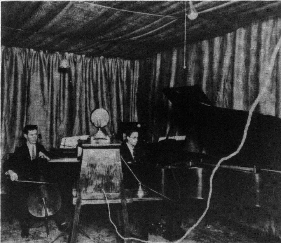
The original CKUA Radio studios as they appeared in 1926.

crossed the Atlantic (and the equally wet expanse of Eastern Canada) to invade the Far West. Using puns as projectiles and wit in lieu of weapons, they stormed the Alberta debating "citadel," alas unsuccessfully, in the Imperial debate. But if we could out-argue the Commonwealth, the Yanks were too much for vearbook, we read "One hears very little".