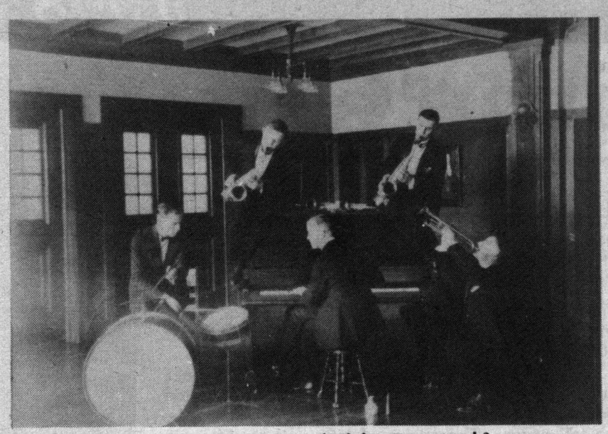
Dance Orchestra, circa 1925. Pretty swingin', crazy cats, eh?

reports are a benefit to society." The U of A could hold its own within