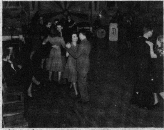
This is what a typical St. Joseph's college dance around December 1940 would