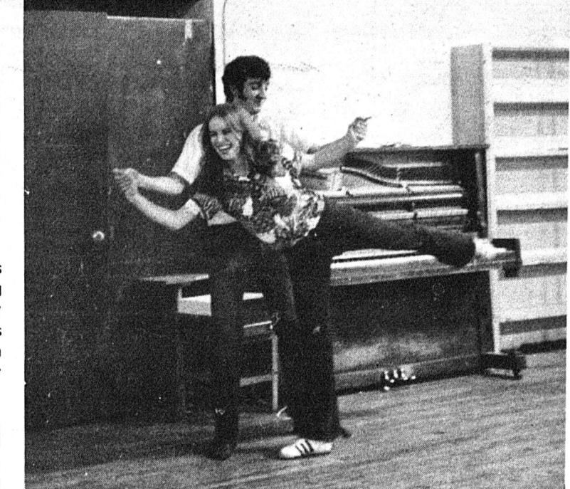
Here are a couple of enthusiastic Jubilairies rehearsing a scene from their newest production about the sexual awakening of college freshmen.

The tickets for the show, which will be performed the 23 and 24 of November will be on sale at $1.00 a piece. If you are interested at all in amateur productions it would be worth spending a couple of dollars to see it.