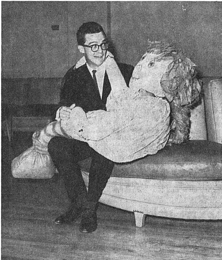
RAG-DOLL and Dave, students' Union president promote UCF on campus.

Mr. Prowse commented on Prime Minister Diefenbaker's post-election announcement of a federal austerity program. He said it was shocking that a man in that position would stoop to such dishonesty in view of the Conservative election platform.