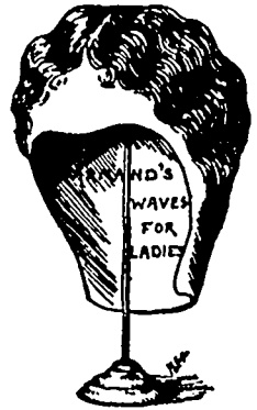
$7.00 to $15.00.

J. TRANGLE-ARMAND & CO., 441 Yonge St., cor. Carlton, TORONTO, CAN.