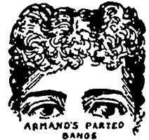
Lovely Style of Bang, $3.00 to $7.00.