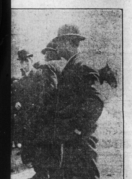
SCRIBNER'S CORNER .- Courtesy) of

re used to retain the aldermanic sys the result, showing that the indepen re were not many spoiled ballots ering the two plebiscites. Some silly riting across the face "Socialism the "Socialism the only thing for hu