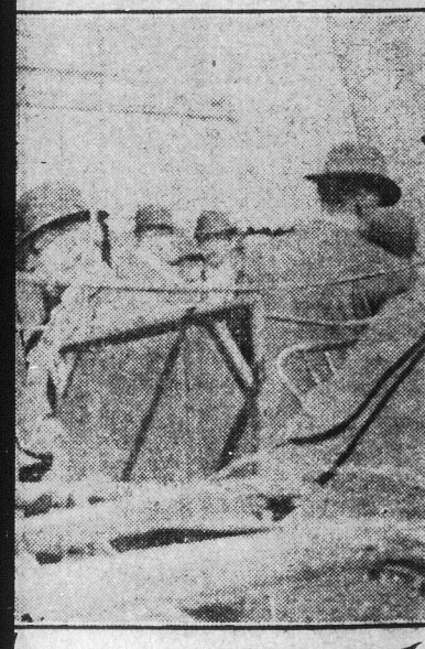
FORCES IN PRINCE WARD. Cour-

ting in Dufferin ward to protest gainst the alleged disenfranchisement of men who had not paid their taxes. Owing to the large vote cast, the rearns were very late in coming in, Welngton being the last received. The citi