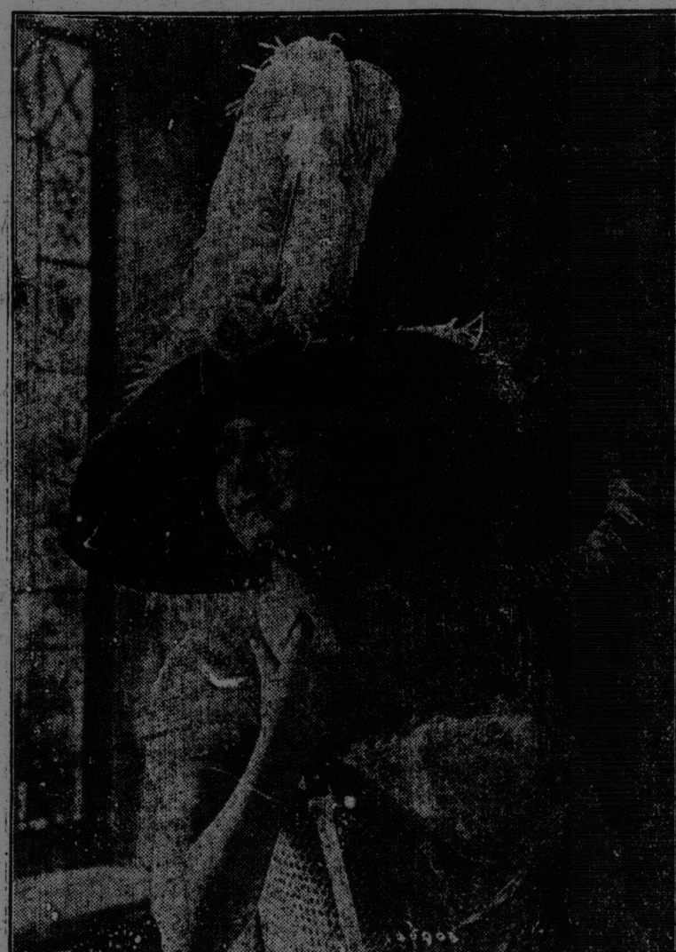
This is the very latest from Paris and London. It is of black Neapolitan straw, with a flat white ostrich feather, uncurled, running flat round the brim, and with a large full white ostrich plume held by pink roses in front. It is rem-