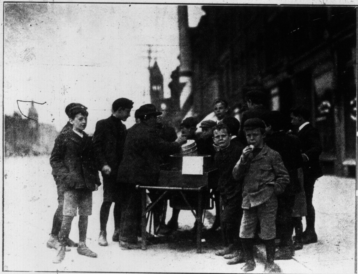
WHEN THE VOICE OF THE ICE CREAM VENDOR IS HEARD IN THE LAND. Familiar street scene near one of the city schools, when the lads with a penny to spend—and the lads who wish they had a penny to spend—congregate about the "cone-man."