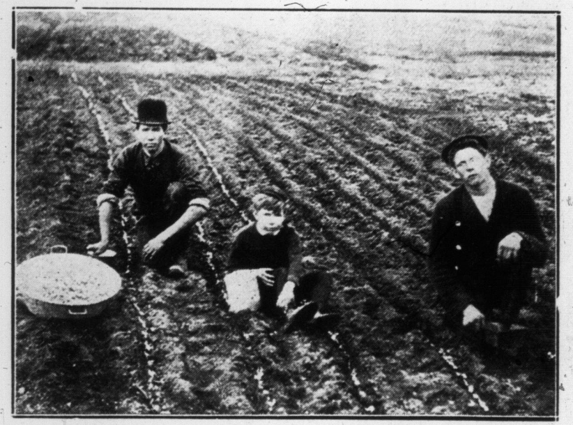
BUSY DAYS FOR THE MARKET GARDENER. Planting onions on a garden farm two miles out of Toronto. Seeding, this spring, took place two weeks earlier than usual.