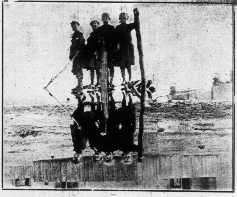
LITTLE NATURE STUDENTS AT NATURE'S MIRROR. Logan-avenue young people studying their shadows at a clear pool, on a spring day.