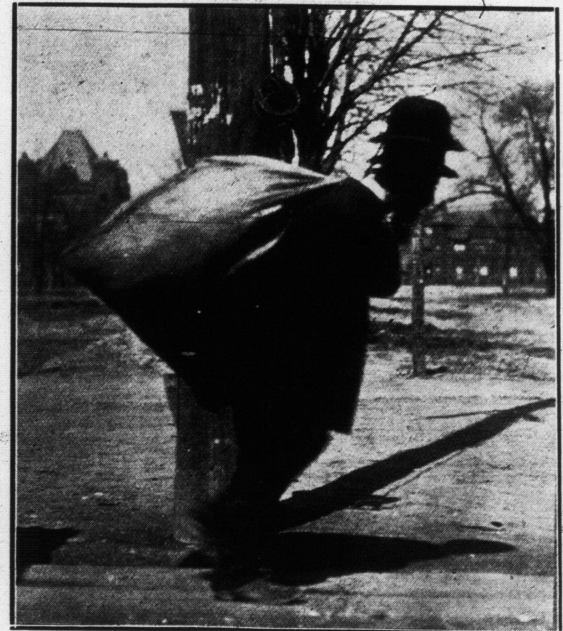
"WHERE THERE'S A WILL THERE'S A WAY." A good day for hats with the Hebrew rag-collector of the Ward.