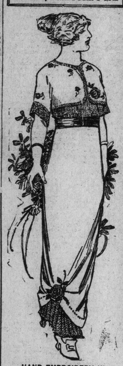
HAND EMBROIDERY IN COLORS.