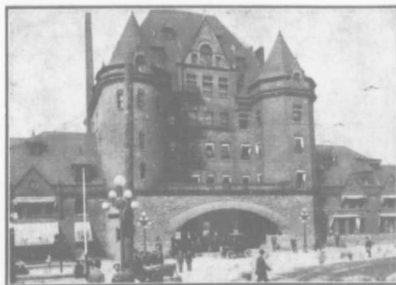
THE CANADIAN PACIFIC RAILWAY DEPOT

An increase of over 70 per cent. in four years. City mains, 174 miles. Hydrants, 902.