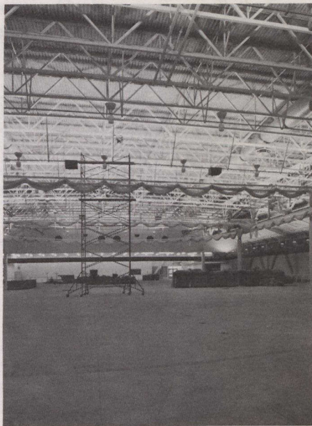
Fieldhouse, when finished, will have five-lane track and portable running rail.

A bar circles the area where a track will soon be poured for blind runners so they can touch it as they run by themselves. The track itself will be made of a new synthetic polymer, designed to cushion the jars to a runner with an artificial leg but made durable enough to withstand a racing wheelchair.