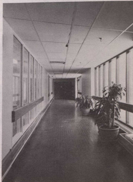
Wooden protectors in halls keep wheelchairs from bumping into wall.

Inside, the main connecting floors have a slightly bumpy surface to guide the blind.