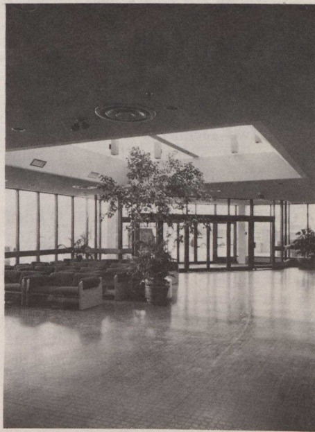
Entrance has permanent ramps and canopy with overhead heating.

Telephones are wheelchair height and in case of fire a stroboscopic light signals to the deaf that the building must be evacuated. The most important athletic equipment of many disabled people — their wheelchairs — will be serviced by