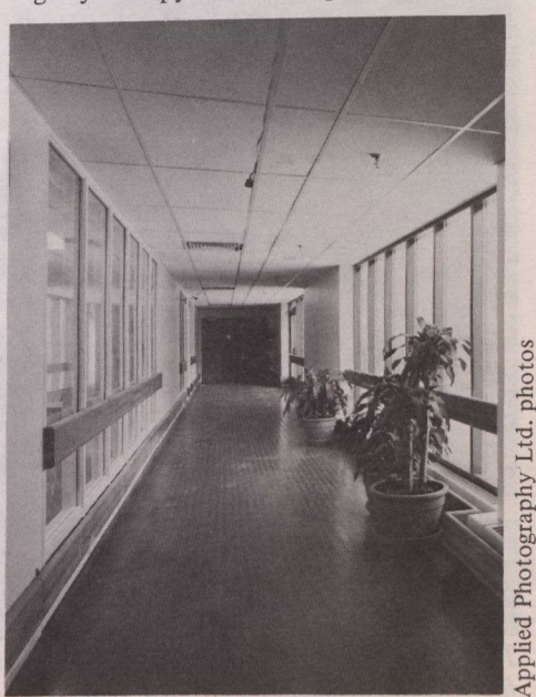
Wooden protectors in halls keep wheelchairs from bumping into wall.

Inside, the main connecting floors have a slightly bumpy surface to guide the blind.