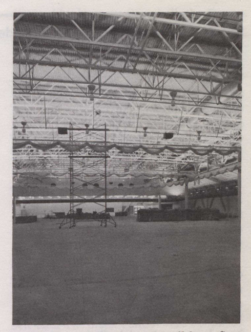
Fieldhouse, when finished, will have fivelane track and portable running rail.

The basketball backstops on the threecourt-long playing area can be raised or