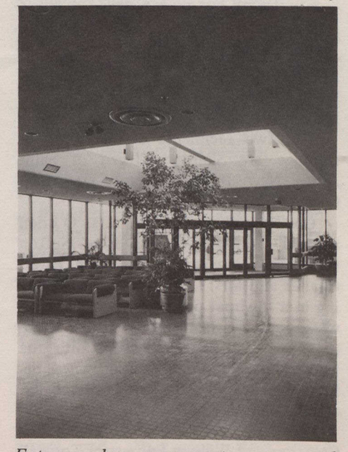
Entrance has permanent ramps and canopy with overhead heating.

Telephones are wheelchair height and in case of fire a stroboscopic light signals to the deaf that the building must be evacuated. The most important athletic equipment of many disabled people – their wheelchairs – will be serviced by