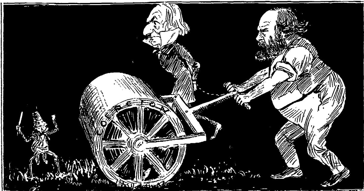
SALISBURY'S MACHINE FOR SMOOTHING THE AFFAIRS OF IRELAND.