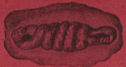
A Strand of Lead Wool coiled up for transit