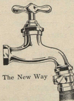
The New Way