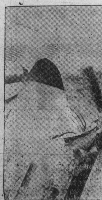
A Campbellton Sister of Charity.

The Bank of New Brunswick was the first to commence the erection of a permanent building. A fine wooden building is being erected in the rear of the old site, while a large number of men are clearing the old site and will begin building at once.