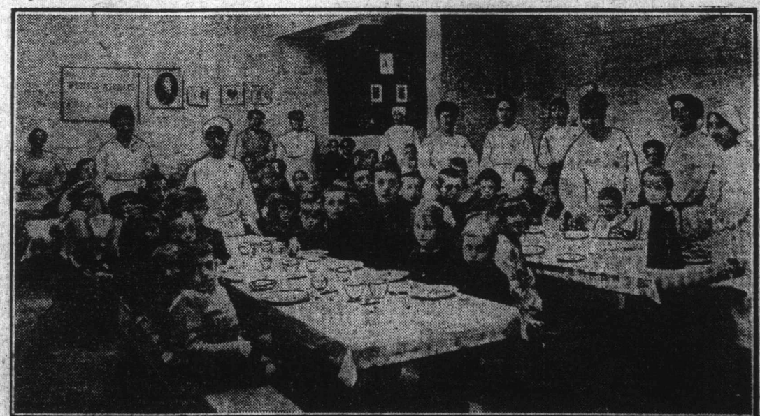
FEEDING BELGIAN CHILDREN AT BRUSSELS—NOTE THEIR STARVED LOOK