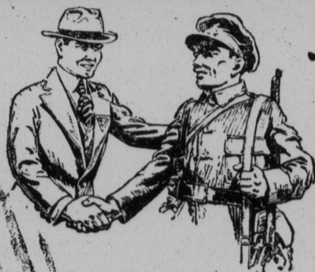
The Y.M.C.A. will keep its chain of Service unbroken till the end.

We ask now your continued sympathy and support for Red Triangle Service for our Soldiers during demobilization, and for Y.M.C.A. work for Canada generally during the Reconstruction period. The Annual Red Triangle campaign will be held throughout Canada May 5th to 9th, 1919. The objective is $1,100,000.