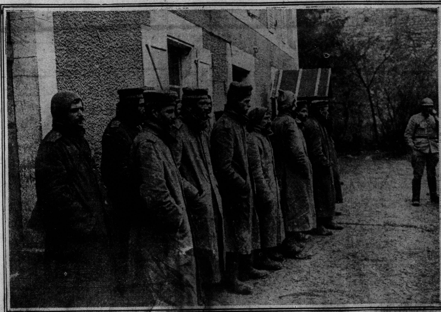
GERMAN SOLDIERS CAPTURED BY FRENCH AROUND VERDUN THESE PRISONERS ARE ONLY A FEW OF THE GERMAN SOLDIERS WHO HAVE BEEN CAPTURED BY THE FRENCH IN THE GREAT BATTLES THAT HAVE BEEN RAGING AROUND VERDUN. THEY ARE OBVIOUSLY ONLY SECOND OR THIRD LINE TROOPS, AND THE MAJORITY HAVE THE APPEARANCE OF BEING WELL ADVANCED IN YEARS.

GERMANS WHO FOUGHT AT VERDUN NOW PRISONERS OF WAR