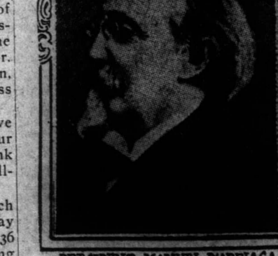
President Manuel Arriga of the Republic of Portugal is sinking rapidly. He is suffering from kidney trouble, complicated with heart disease. There is only a slight hope of President Arriga's recovery.