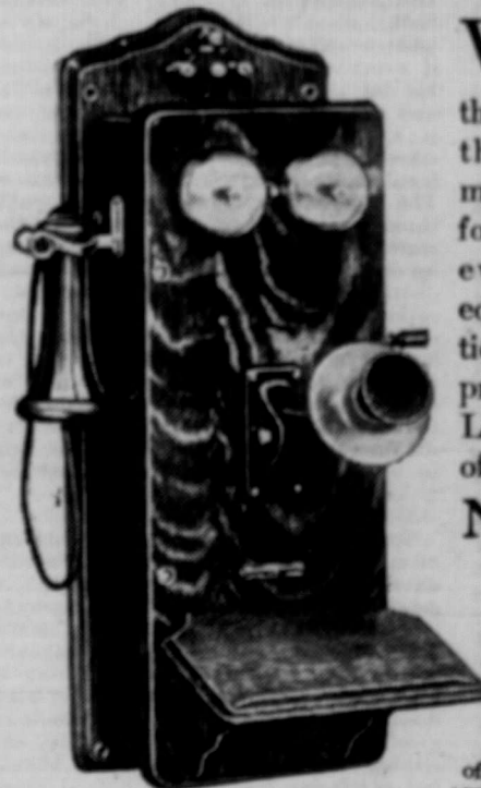
The strongest ringing and talking telephone made.

Capacity 55 (wine) gallons. Price $10 each f.o.b. W. Peg.