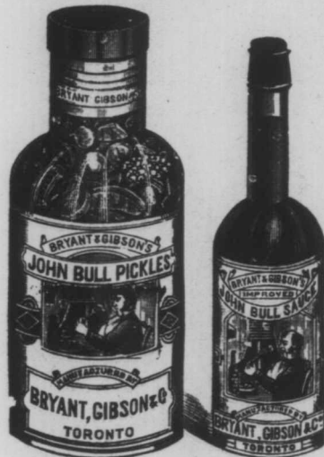
This is a facsimile of our bottles.

BRYANT, GIBSON & Co., TORONTO, Manufacturers of