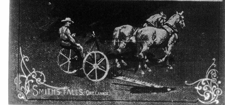
REDUCED FACSIMILE OF OUR 1901 HANGER.

F. & W. Machines are UP TO DATE. Send for our new catalogue.