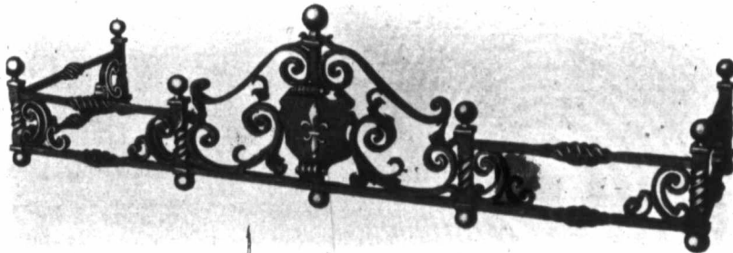
FIRE DOGS AND FIRE PLACE FRAME. BOWER-BARFFED.