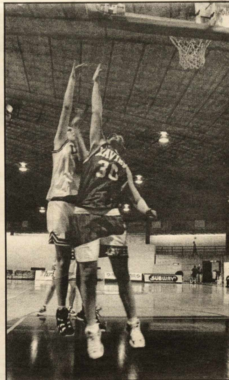
Women's basketball in action at the Dalplex on Jan. 13 where the Tigers beat St.FX 59-53. Dal dropped two games to Memorial the following weekend, losing 62-67 on Jan. 17, and 55-72 on Jan. 18.