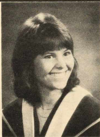
This is one of several styles

7.50 FOR YOUR SITTING You keep your proofs