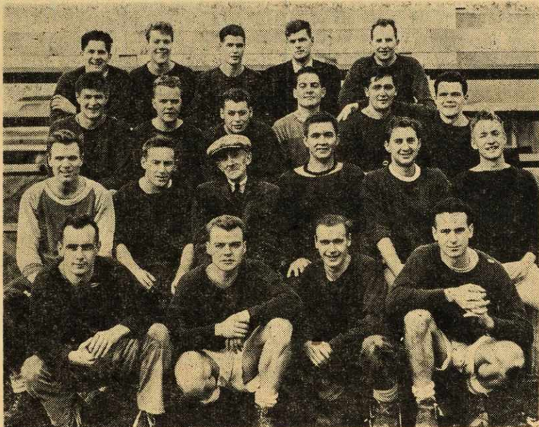
Pictured above is the Law Rugger team, champions of the Dal Inter-Fac Rugby Competition for '53. Law defeated Meds 2-0 last Wednesday to win the league from last year's champs.