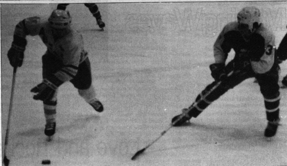
The Bears will try to stickhandle around Manitoba Bisons this weekend.

"Sometimes we're great defensively and we can't put the puck in the ocean," Bison coach Barry Trotz said, "Sometimes we score a lot and we let a lot of goals in. We're lacking a lot of consistency."