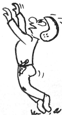
LAYOUT BRIAN CREDICO

U b b C d d e V s n o n e c b w P W E c g w f C F p i o n n N