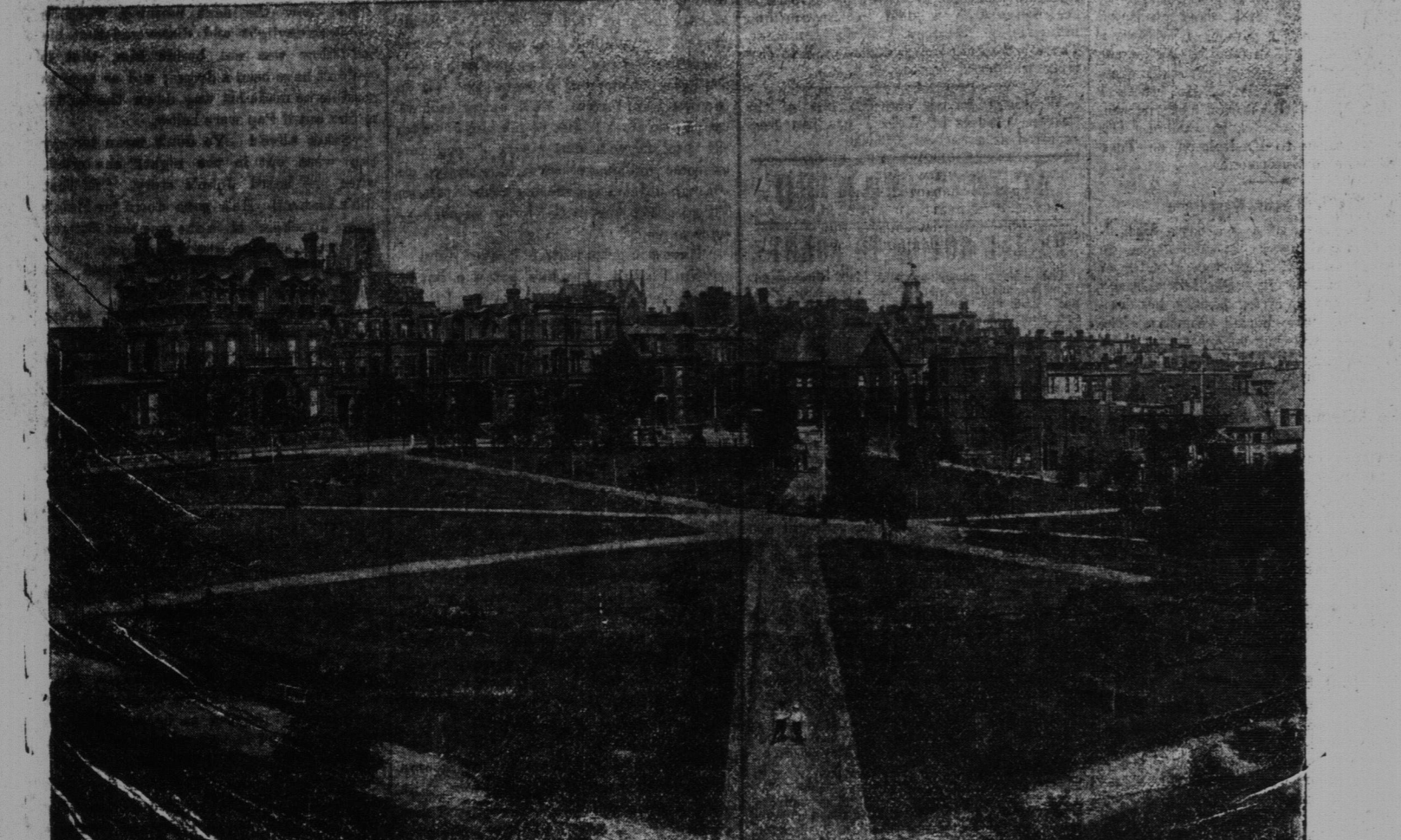
QUEEN SQUARE, ONE OF ST. JOHN'S BEAUTY SPOTS.